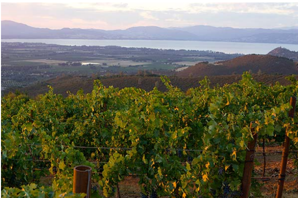
The Fortress Vineyard 2400 feet elevation above Clear Lake